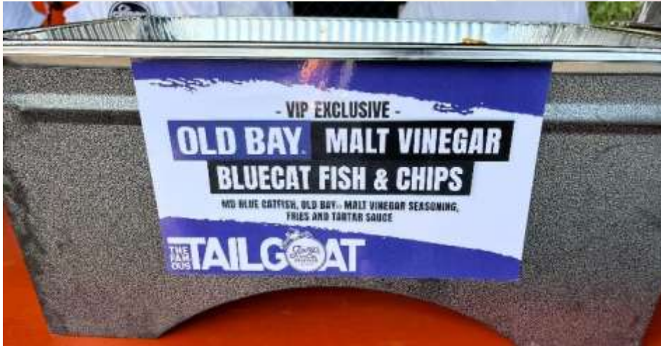
Partnership with local businesses