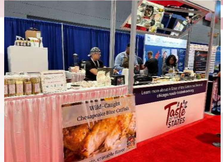
National Restaurant Show Taste of the States