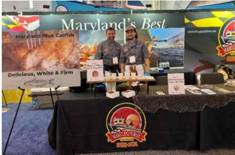
Seafood Expo North America