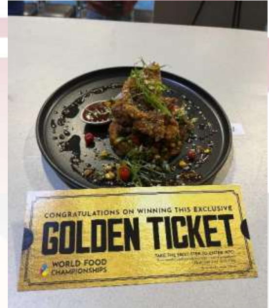
Maryland Restaurant Association